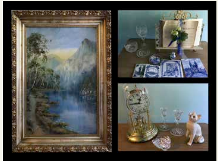
Some of the lovely objects donated and sold in last year's Landmark Lawn Sale.

For more information about the sale or to make a donation, contact the museum at 315-343-1342 or email ochs@rbhousemuseum.org