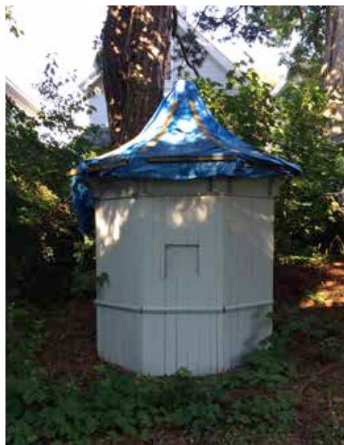
Octagonal Rubbish Shed