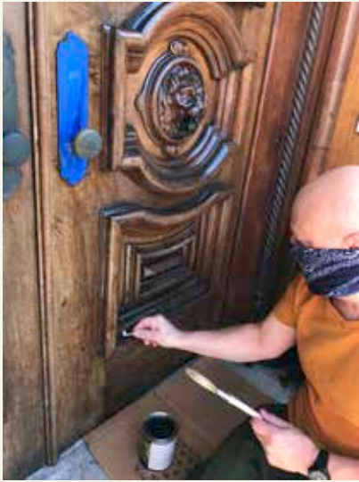
David D'Ambrosio sanded and put a fresh coat of marine varnish on the front doors.