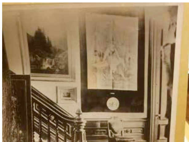
Tapestry wall hanging in 1880's photo

Rose Garden - A new fence is needed for the eastern border of the south lawn, so that plans can proceed for the restoration of Florence Bates's Garden. (The fence is approximately $1,200 and then donations toward the cost of topsoil, roses and annual flowers will be appreciated.)